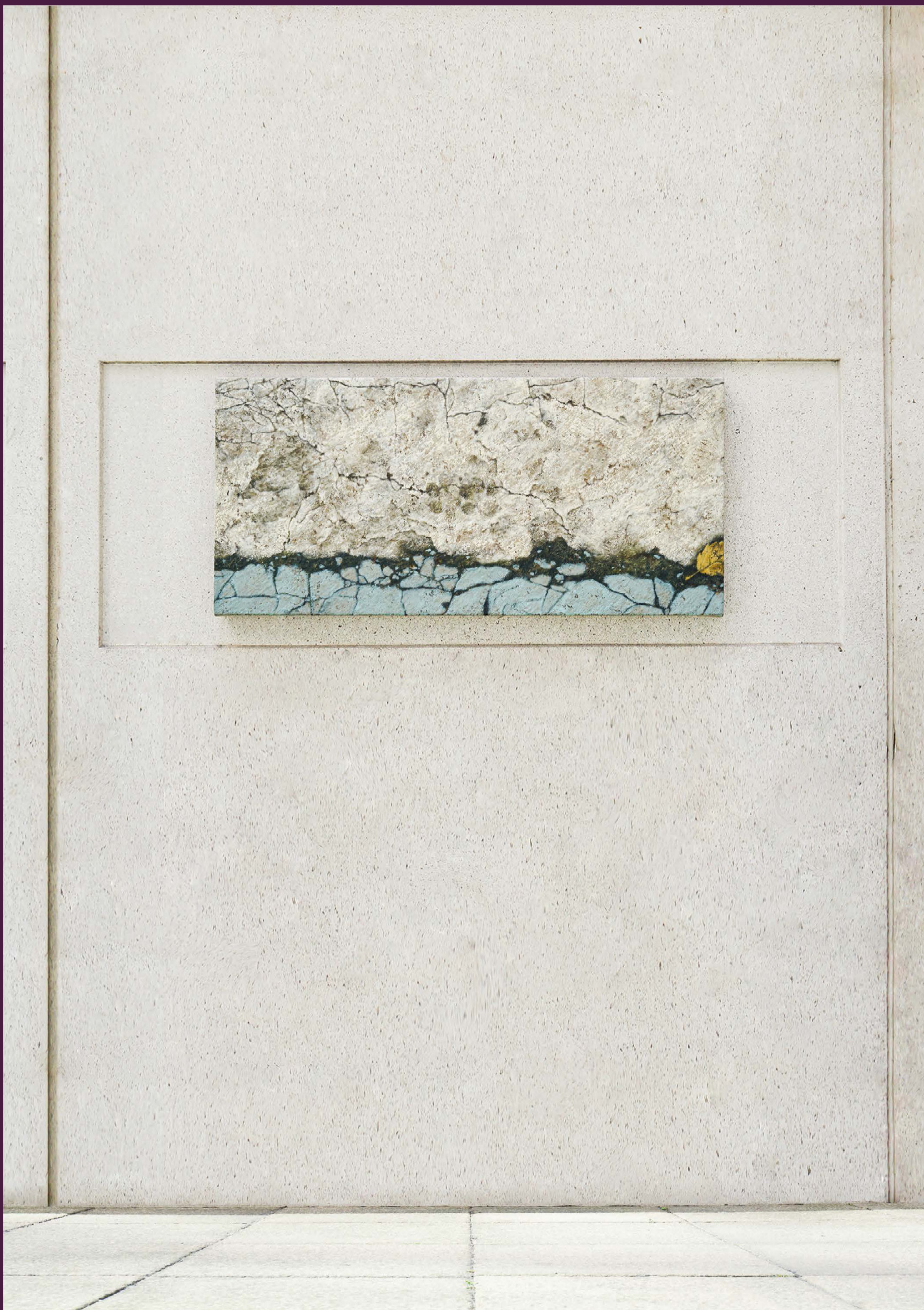
Run!!, 2026 Jingshan Ding

Oil and acrylic on linen, 41 x 88 cm Installation view in London